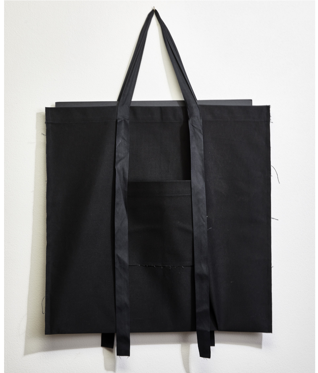
CUSTOM HAND MADE GIFT BAG FROM ROBUST COTTON CANVAS