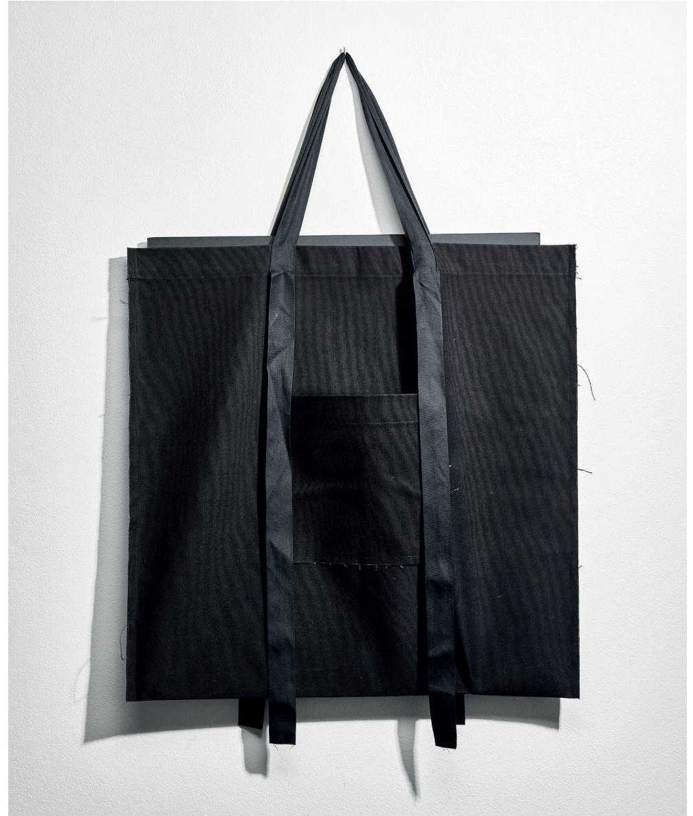
CUSTOM HAND MADE GIFT BAG FROM ROBUST COTTON CANVAS